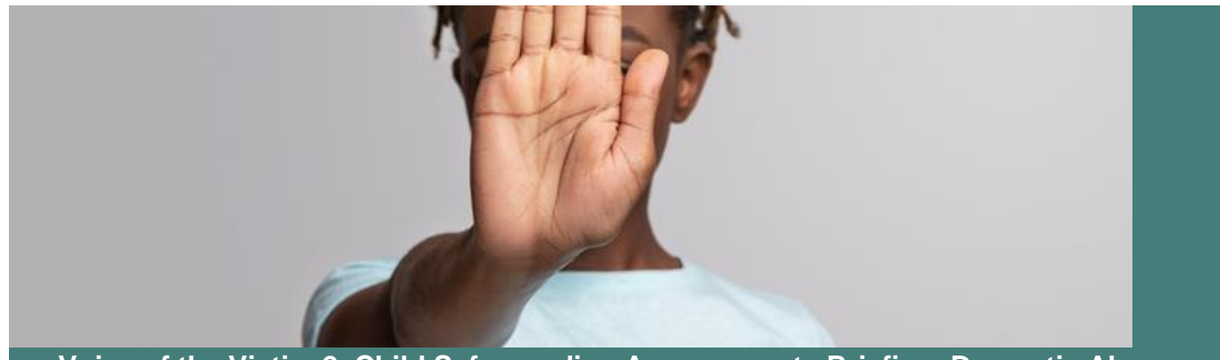
Voice of the Victim 2, Child Safeguarding Arrangements Briefing, Domestic Abuse Project and Horizon Scanning Report

Working with the National Police Chiefs' Council's (NPCC), the Violence and Public Protection (VPP) lead and funded by the Home Office, the VKPP undertake a range of direct engagement with forces and key partners to understand current practice, identify promising practice, gaps and share knowledge and shape future responses with emphasis on the 14 strands of public protection. Our work also directly supports critical workstreams within policing, such as Violence Against Women and Girls (VAWG).